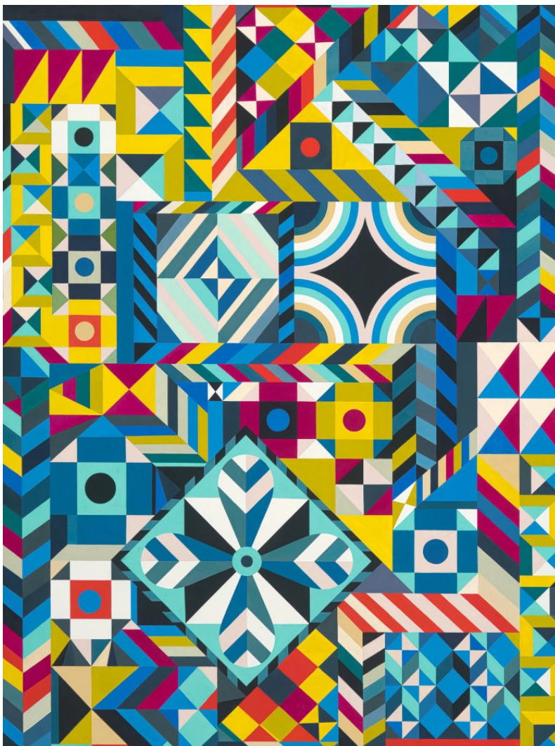
Sarah More Wonderland, 2023 acryla gouache on panel 24 x 18"