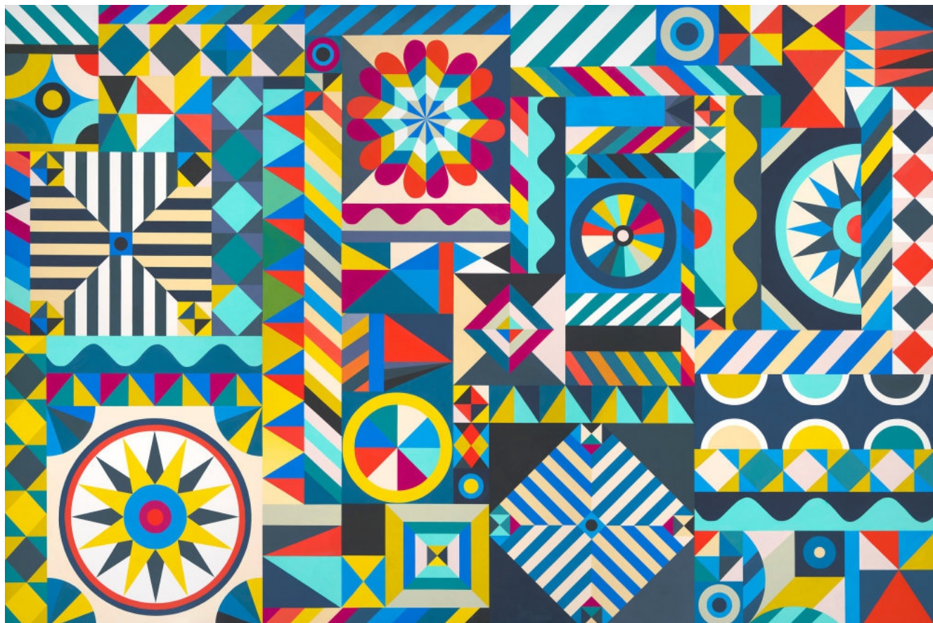
Sarah More Motherboard 2, 2022 acryla gouache on panel 48 x 72 x 2"