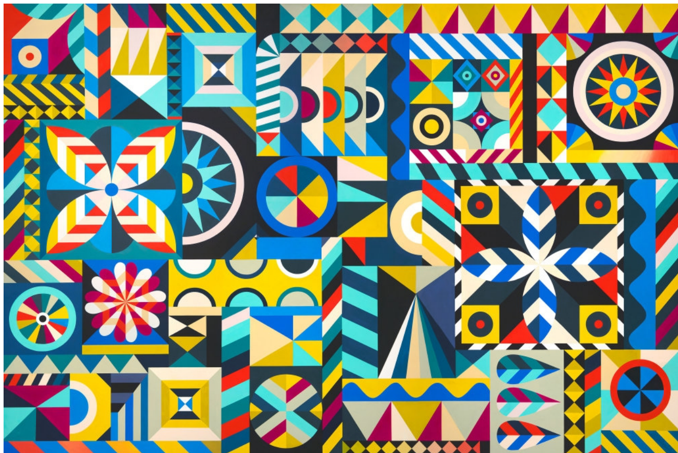
Sarah More Motherboard 1, 2022 acryla gouache on panel 48 x 72 x 2"