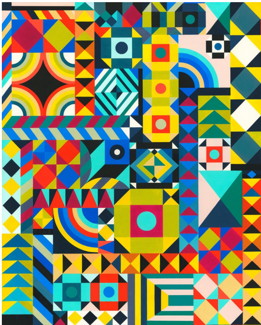
Sarah More Drunkards Path , 2023 acryla gouache on panel 20 x 16"