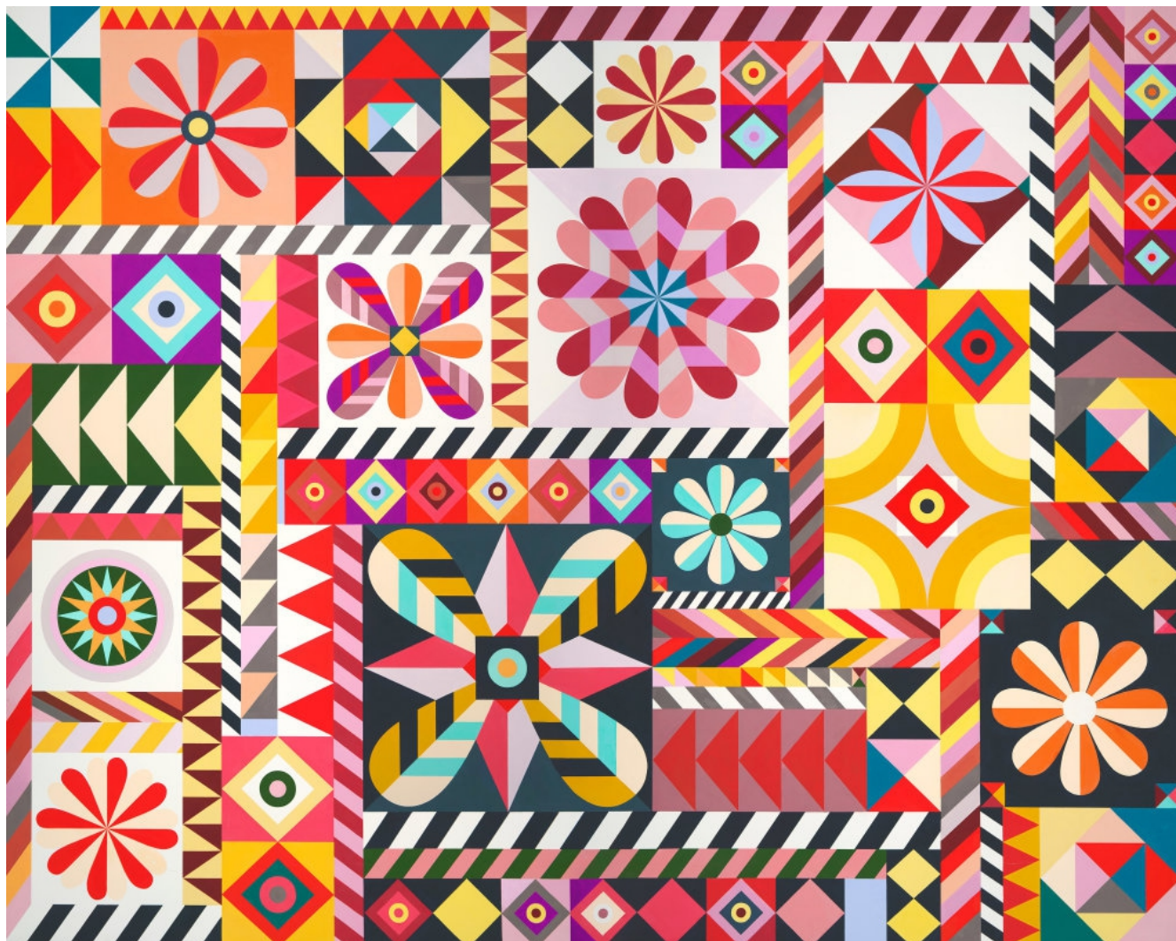
Sarah More Rose Parade, 2022 acryla gouache on panel 48 x 60"