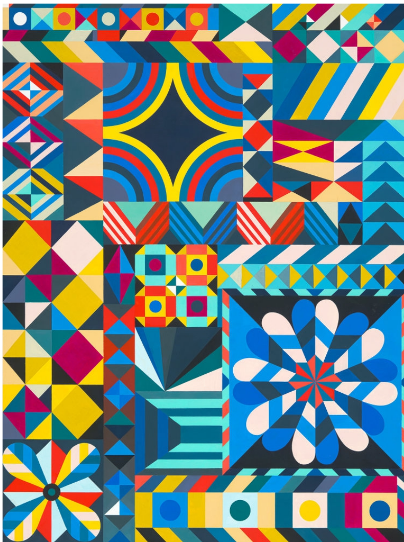
Sarah More Daily Jumble , 2023 acryla gouache on panel 24 x 18"